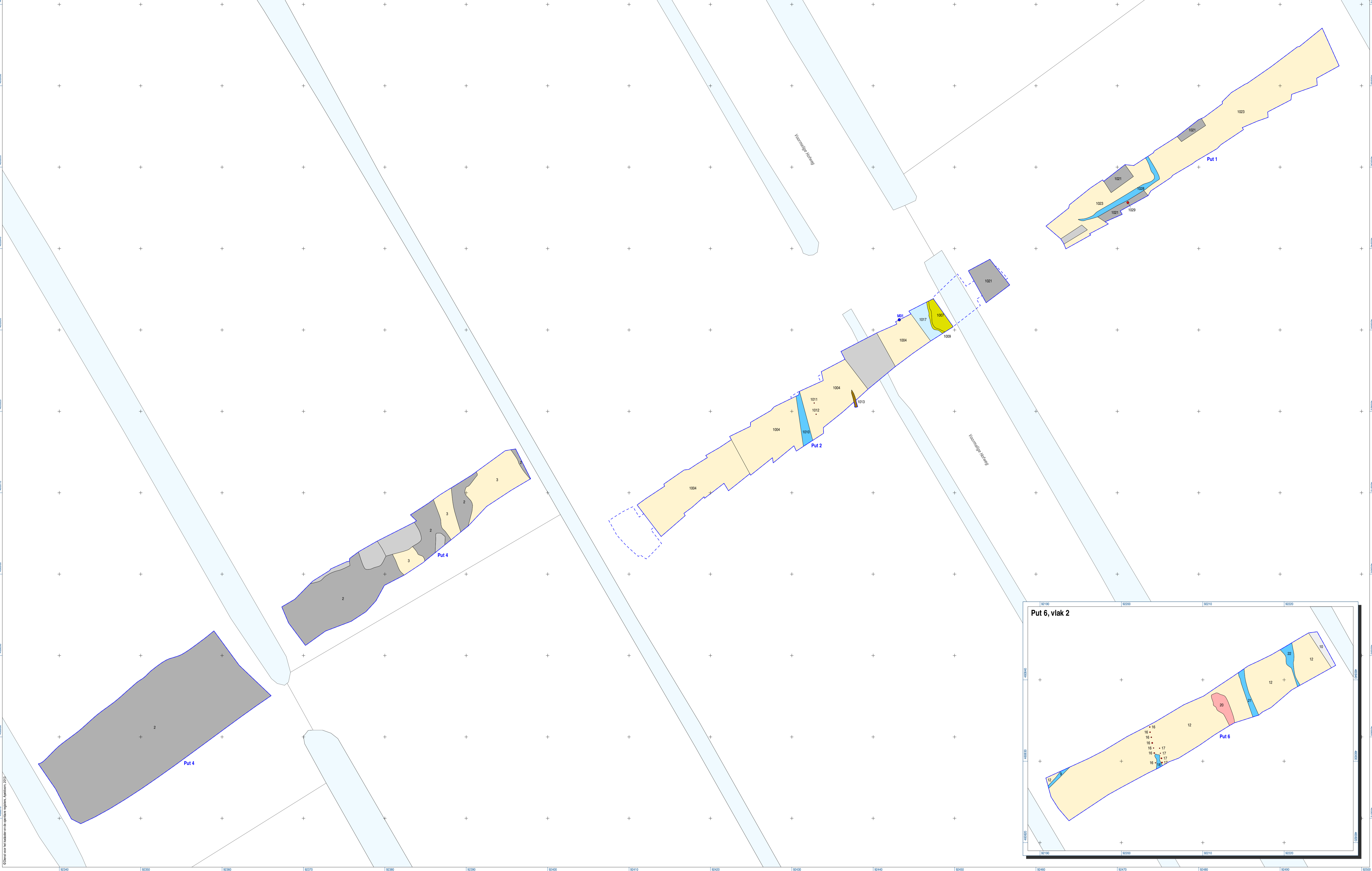
Put 1, 2 en 4, vlak 2